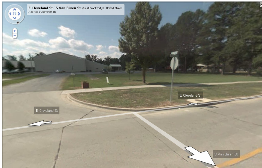
Corner of East Cleveland

West Frankfort Aquatics Center—1100 E Cleveland St, West Frankfort, IL 62896