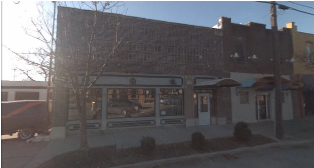
Carbondale Township Office

Carbondale Township Office—217 East Main Street, Carbondale, IL 62901