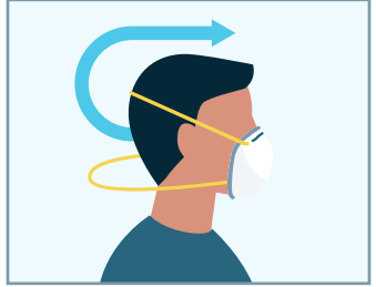
Pinch bottom strap and pull far over head.