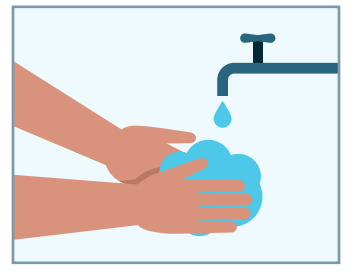
Follow proper handwashing guidelines and then don gloves.